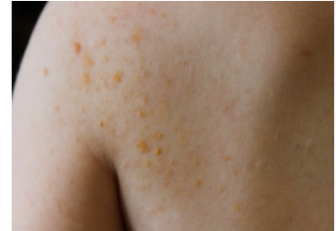
Xanthomas over back

Patients with severe elevations of TGs can have eruptive xanthomas over the trunk, back, elbows, buttocks, knees, hands and feet. Patients with the rare dys-beta lipoproteinemia can have palmar and tuberous xanthomas.