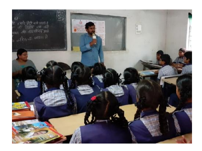
Glimpse of awareness sessions regarding nutrition and hygiene aspects to the Children's and Teaching staff of various schools by NIIMH, Hyderabad