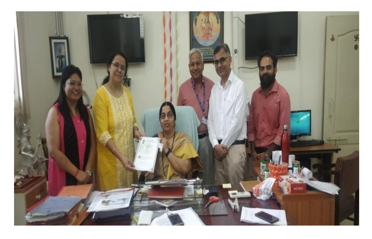
View of Signing of MoU between CCRAS & CBPACS for "Validation & Reliability testing of Ayurveda Diagnostic Tool" on 3<sup>rd</sup> September, 2019 at CBPACS