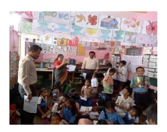
Lecture on personal hygiene and importance of diet and nutrition to students of LKG to 4<sup>th</sup> std. at Karnataka Public school, kaggalipura, bengaluru.