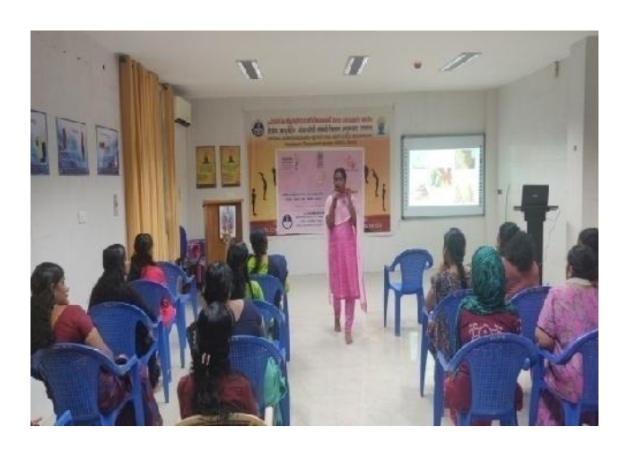
View of Health awareness lecture during Rashtriya Poshan Maah at RARILSD Thiruvananthapuram