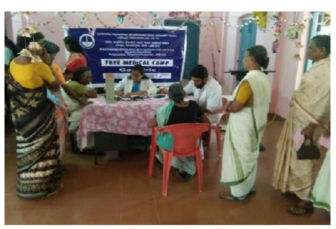
View of Free Geriatric Medical Camp organized by RARILSD, Thiruvananthapuram

Geriatric Camp organized at Mudavanmugal Old Age Home; Kovilvila Temple Auditorium, Vembayam and Govt. High School, Jagathy on 1<sup>st</sup> July, 2019; 14<sup>th</sup> July, 2019; 7<sup>th</sup> August, 2019; 17<sup>th</sup> August, 2019; 18<sup>th</sup> August, 2019; 31<sup>st</sup> August, 2019 and 28<sup>th</sup> September, 2019. Laboratory investigations and free distribution of medicines were provided and a total of 288 patients benefitted.