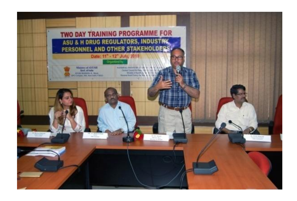
Glimpse of two days "Training Programme for ASU&H Drug Regulators, Industry personnel and other Stakeholders" on 11<sup>th</sup> - 12<sup>th</sup> July, 2019 at NIIMH, Hyderabad