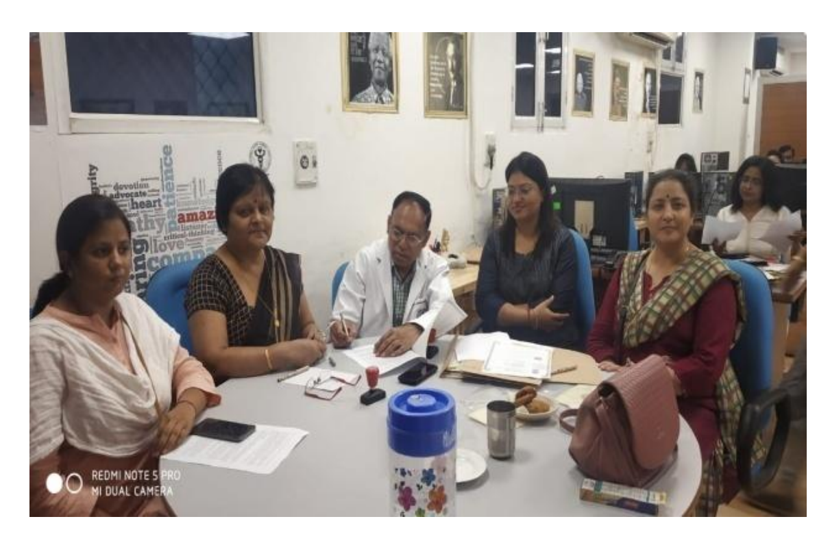
An MoU signed Between CCRAS & AIIMS for "An investigation to evaluate the efficacy of Cannabis leaf preparation along with the cancer chemotherapy in patients with locally advised solid tumours in improving quality of life & minimizing side effects of the chemotherapy" on 30<sup>th</sup> September. 2019 at AIIMS, New Delhi