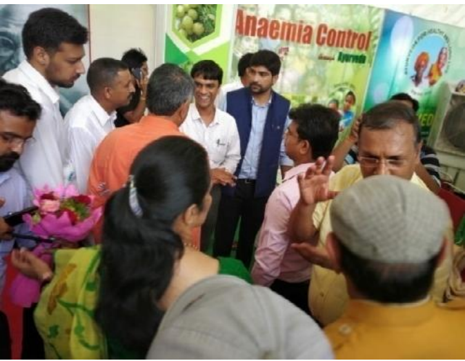
View of CCRAS Stall at "Rise in Haryana 2019"- A mega Exhibition at Panchayati Ramleela Ground, Hansi, Haryana from 29<sup>th</sup> August, 2019 to 31<sup>st</sup> August, 2019