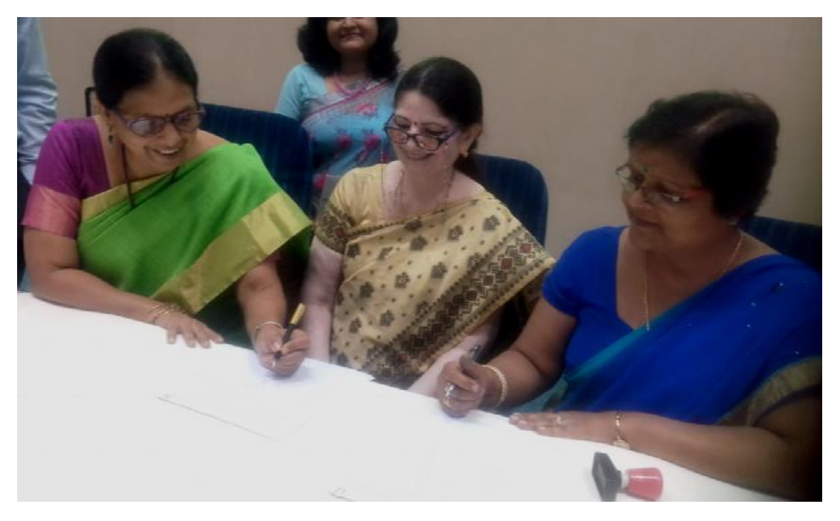
An MoU signed between CCRAS & AllA for the project 'Validation and Reliability Testing of Ayurvedic Diagnostic Tools' on 30th August, 2019 at Vigyan Bhavan, New Delhi

Central Ayurveda Research Institute for Cardiovascular Disorders (CARICD), Punjabi Bagh, New Delhi, participated on behalf of the Council in 'Rise in Haryana 2019 – A Mega Exhibition' organized by Tarmeh Events Pvt. Ltd., New Delhi at Hansi, Haryana from 29<sup>th</sup> - 31<sup>st</sup> August, 2019. During the event, display stall arranged for the visitors in which Council's Publications displayed.