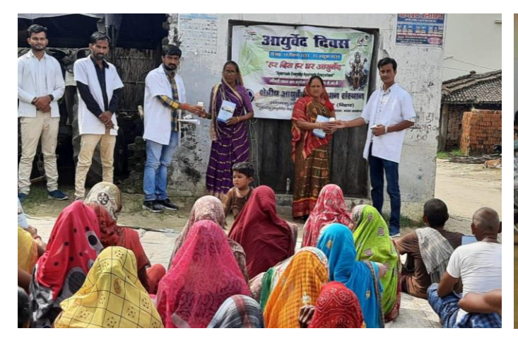
The Medical team of RARI, Patna distributing prophylactic medicines as a part of the celebration of 7<sup>th</sup> Ayurveda day