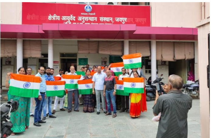
MSRARI, Jaipur celebrated 'Har Ghar Tiranga' campaign by distributing National Flag among the Officers & staff of the institute