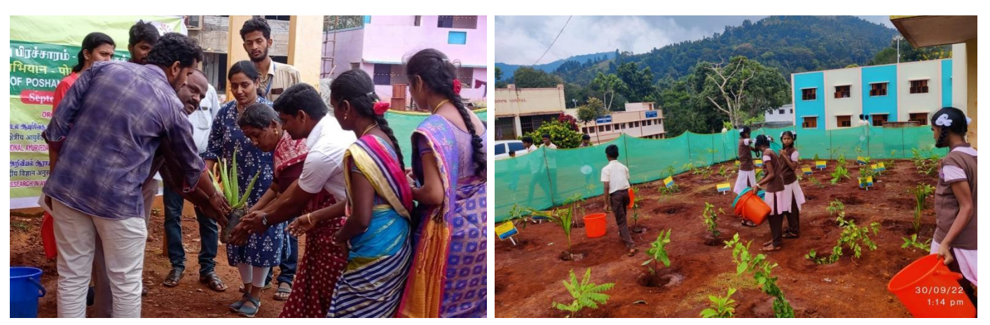
Glimpse of establishment of Poshan Vatika at Eklavya Model Residential School, Sengarai as a part of Rashtriya Poshan Maah by ALRARI, Chennai.