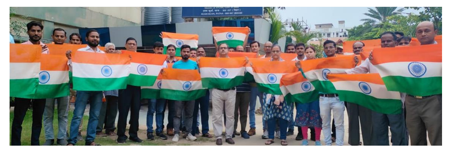
Glimpse of the celebration of 'Har Ghar Tiranga' campaign under Azadi ka Amrit Mahotsav at RARI, Patna