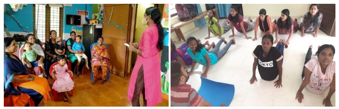
Glimpse of awareness session on breast feeding practices among lactating mothers and yoga demonstration for adolescent girls as part of 5th Poshan Maah by RARI, Thiruvananthapuram.