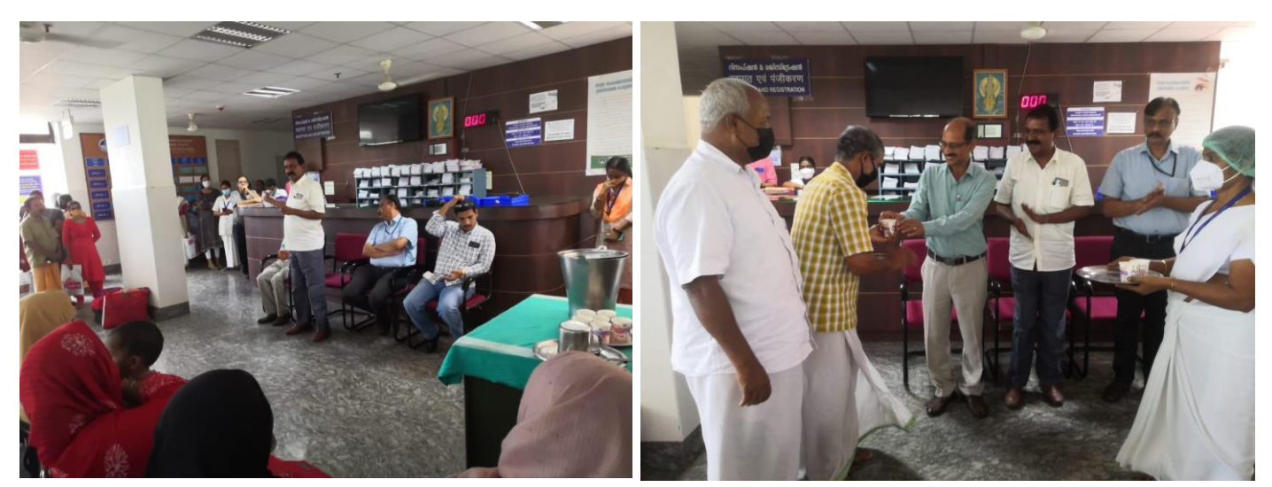
Glimpses of the distribution camp of Karkidaka kanji (medicated gruel which is a unique combination of herbs, spices, and grains that would keep the monsoon fevers at bay and acts as a prevention against some of the common diseases of the rainy season) organized at NARIP, Cheruthuruthy on 18<sup>th</sup> July, 2022.