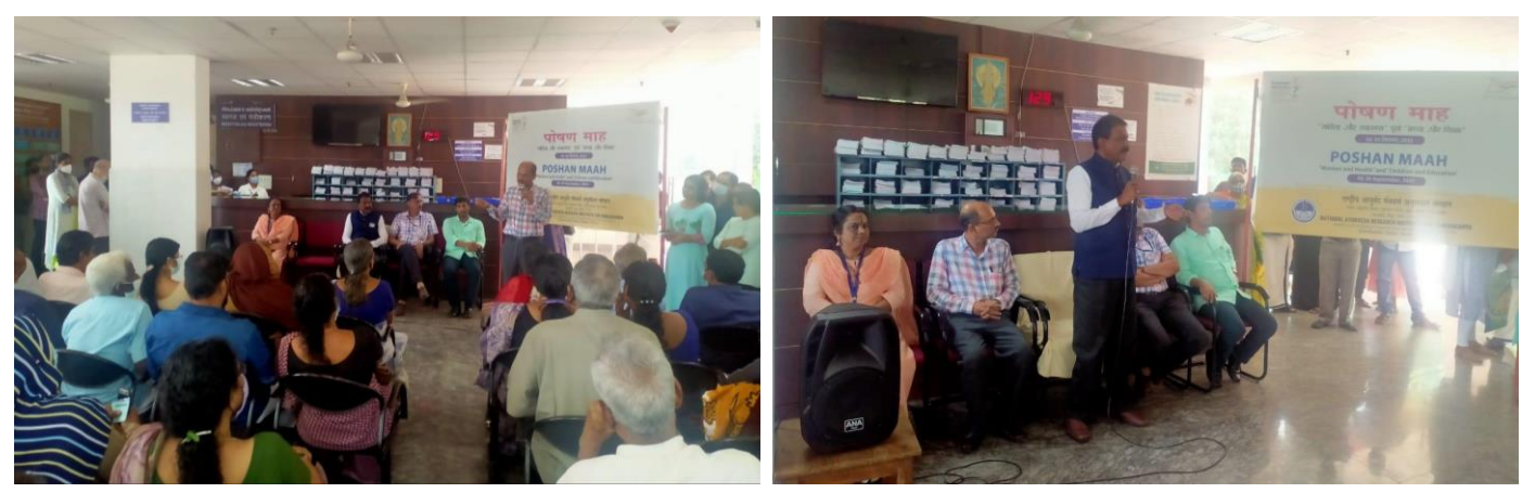
Glimpse of awareness session delivered on 'Importance of proper nutrition and the Role of Poshan Vatika in maintaining health' organized as a part of Poshan Maah celebration at NARIP, Cheruthuruthy.