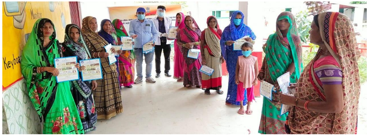
Glimpse of the medical team of RARI, Lucknow distributing Ayush Prophylactic Medicines and Guidelines on diet and lifestyle in the outreach camp of WCH