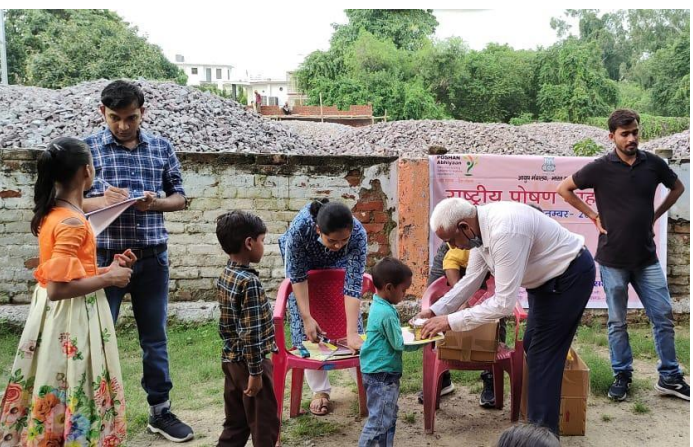
Glimpse of distribution of Nutritional food and IEC material at rural areas of RARI, Lucknow during the celebration of Poshan Maah.