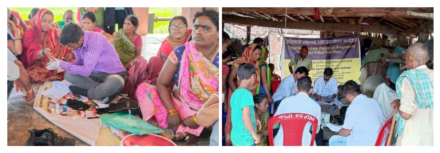
Glimpse of the survey team of RARI, Patna providing free medical consultation & treatment in the outreach camps of AMHCP, THCRP and WCH