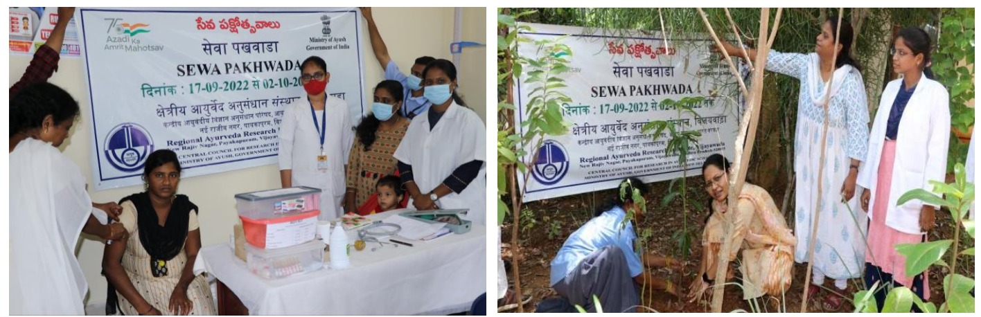
Glimpse of Covid-19 vaccination camp and plantation of medicinal plants organized as a part of the activity of Sewa Pakhwada from 17<sup>th</sup> September, 2022 to 2<sup>nd</sup> November, 2022 by RARI Vijayawada

April–June 2022 | Vol.–IV | Issue–III | www.ccras.nic.in