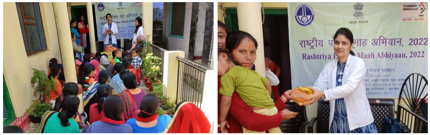
View of activities organized by RARI, Ranikhet during the celebration of Rashtriya Poshan Maah.