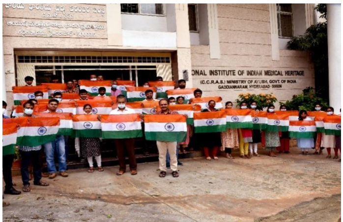
View of Officials and Staff of NIIMH, Hyderabad displaying National Flag as a part of the celebration of "Har GharTiranga Campaign"