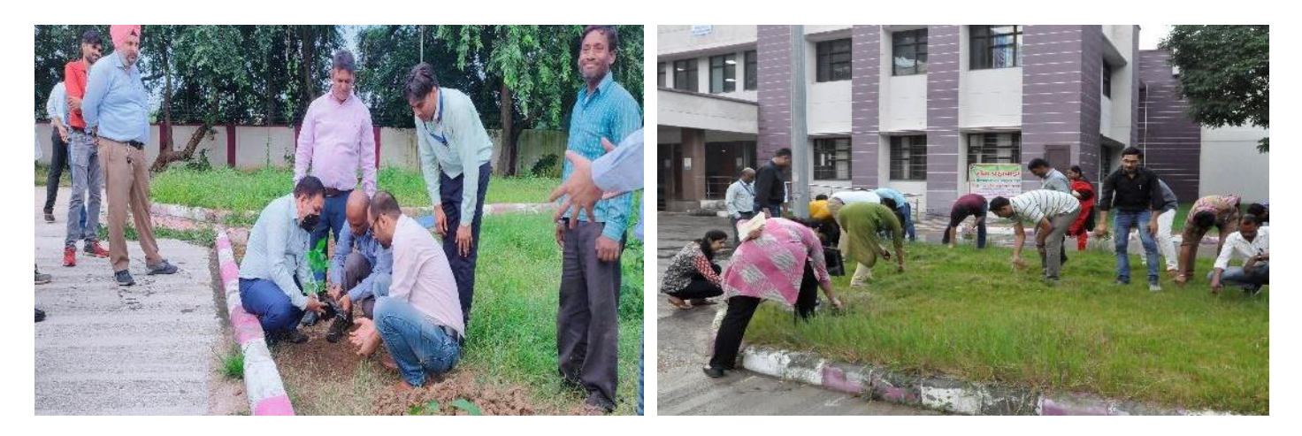
Glimpse of Plantation of Medicinal plants and cleaning of institute premises as a part of celebration of Sewa Pakhwada at CARI, Jhansi

Glimpse of some of the activities organized as a part of Sewa Pakhwada celebration by RARI, Mandi