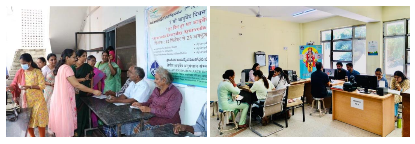
Distribution of IEC Material to the Old age Home by RARI, Vijayawada Medical team as a part of the activity of 7<sup>th</sup> Ayurveda Day.

This year Ayurveda Day is being celebrated with the theme "Har Din Har Ghar Ayurveda " so as to propagate benefits of Ayurveda to larger and grass root communities. Keeping in view with the theme, the Council along with all the peripheral institutes organized various activities under 3-Js i.e. Jan Sandesh, Jan Bhagidari and Jan Aandolan and six week long events from 12<sup>th</sup> September, 2022 to 23<sup>rd</sup> October, 2022. Glimpse of some of the activities are: