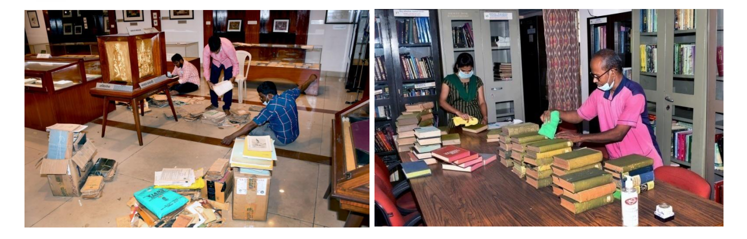
Glimpse of cleaning Activities during the celebration of Sewa Pakhwada at NIIMH, Hyderabad on 28<sup>th</sup> September, 2022