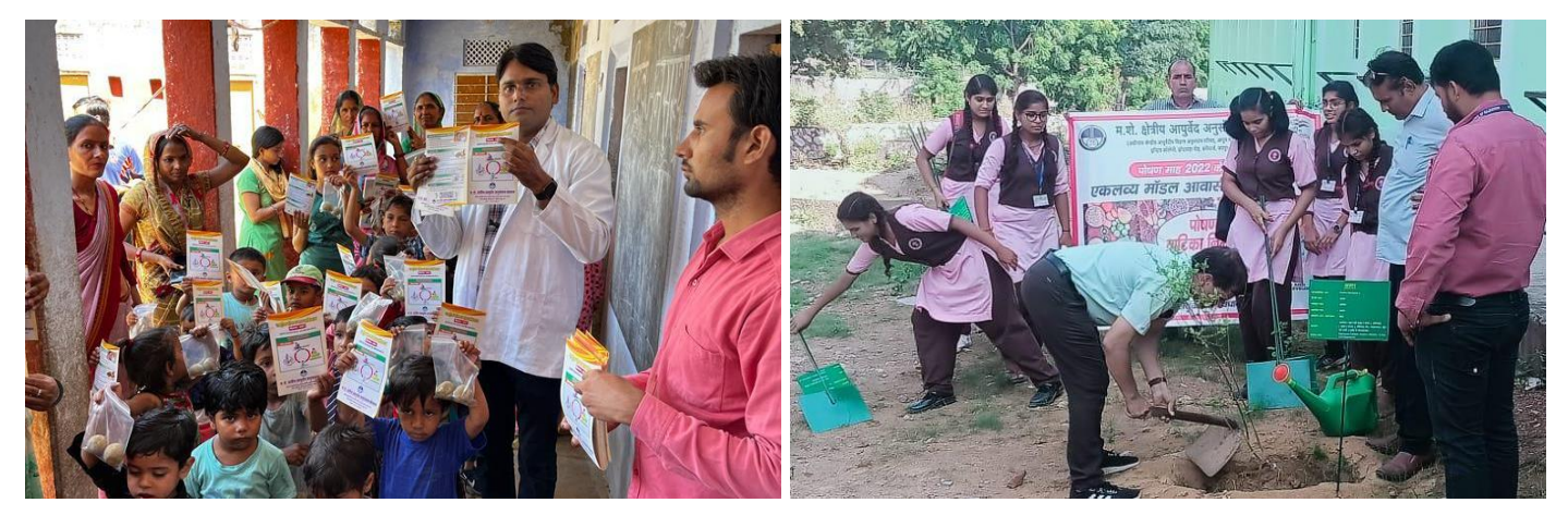
Glimpse of distribution of nutritious food and establishment of Poshan Vatika during the celebration of Rashtriya Poshan Maah by MSRARI, Jaipur