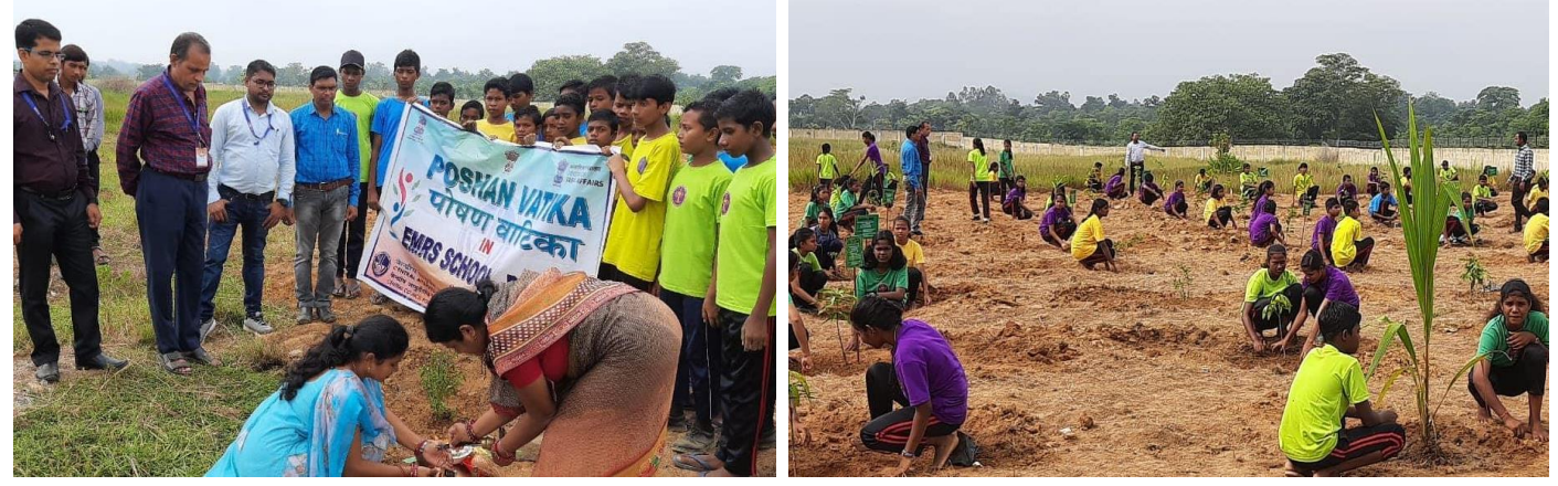
Officials & staff of CARI, Bhubaneswar during the establishment of Poshan Vatika at EMRS, Bahalda as a part of the activity of Rashtriya Poshan Maah