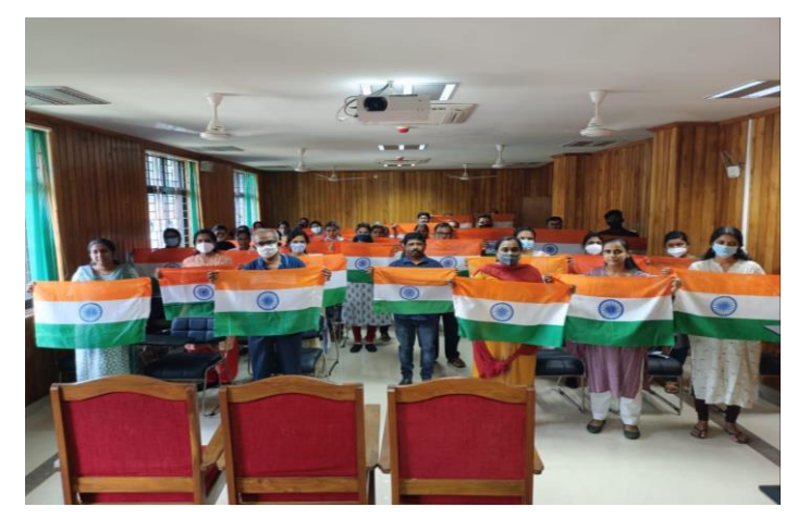
Glimpse of the celebration of Har Ghar Tiranaga campaign organized under Azadi Ka Amrut Mahotsav at RARI, Thiruvananthapuram