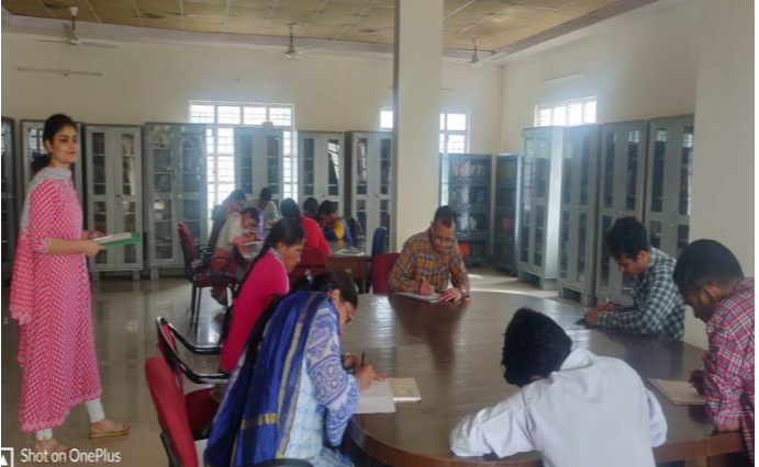
View of essay writing competition organized as a part of Hindi Pakhwada celebration at RARI, Ranikhet during 14<sup>th</sup> - 28<sup>th</sup> September, 2022.