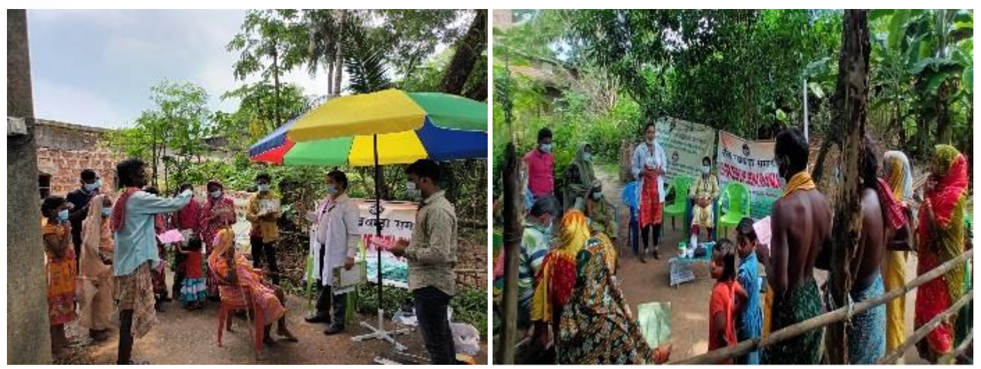
Glimpse of CARI, Bhubaneswar survey team providing free medical consultation & treatment in the outreach camps of THCRP and AMHCP.