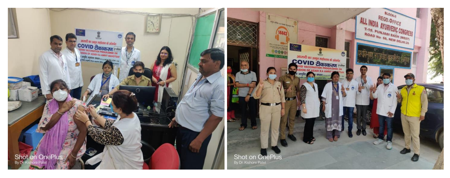
Glimpse of Covid-19 vaccination camp organized at CARI, New Delhi on 27th August, 2022