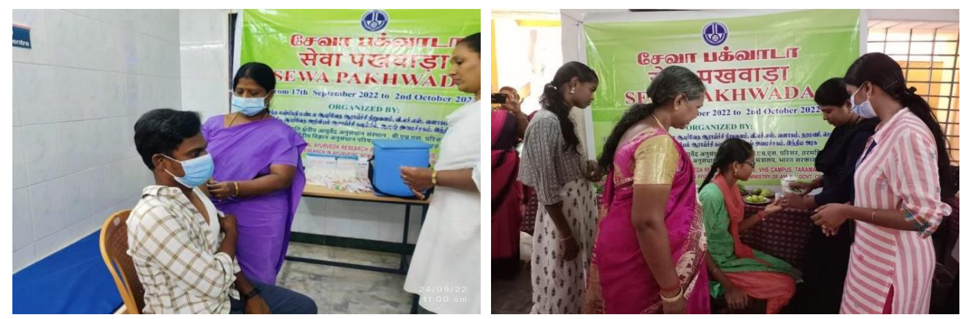
Glimpse of COVID Vaccination camp and Anaemia screening camp organized as a part of the activity of Sewa Pakhwada by ALRARI, Chennai