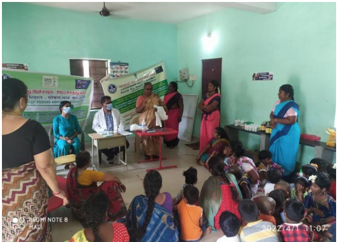
Glimpse of a medical camp and awareness session organised at Anganwadi School, Anakaputhur, Chennai, by ALRARI, Chennai.