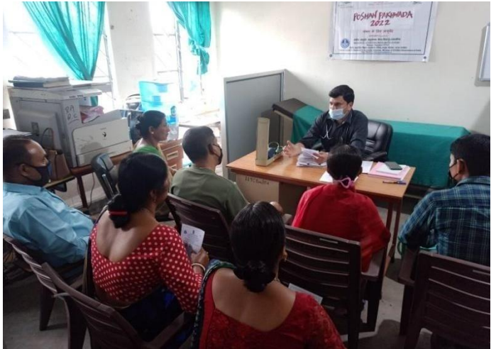
View of awareness session delivered on 'Anaemia and its prevention' among children and school staff of Vivekananda Blooming Buds school, Duncan Basti, Dimapur, on 02 nd April, 2022 by RARC, Dimapur.