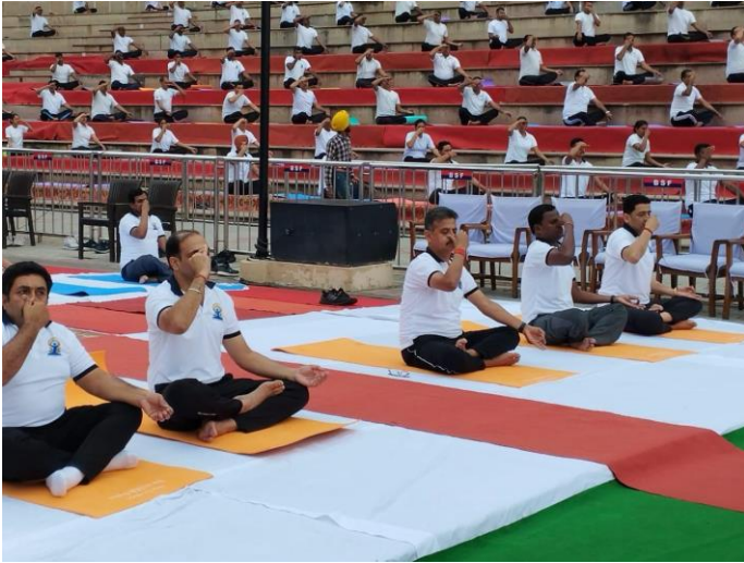
CARI, Patiala celebrated 8 th IDY at Wagah Border, Amritsar with the pioneers performing Yoga.