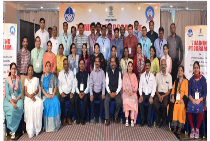
A Training Programme on the implementation of NABH standards for Ayurveda Hospitals was organized by the RARI, Nagpur in collaboration with the NABH-Quality Council of India from 10 th to 12 th May, 2022