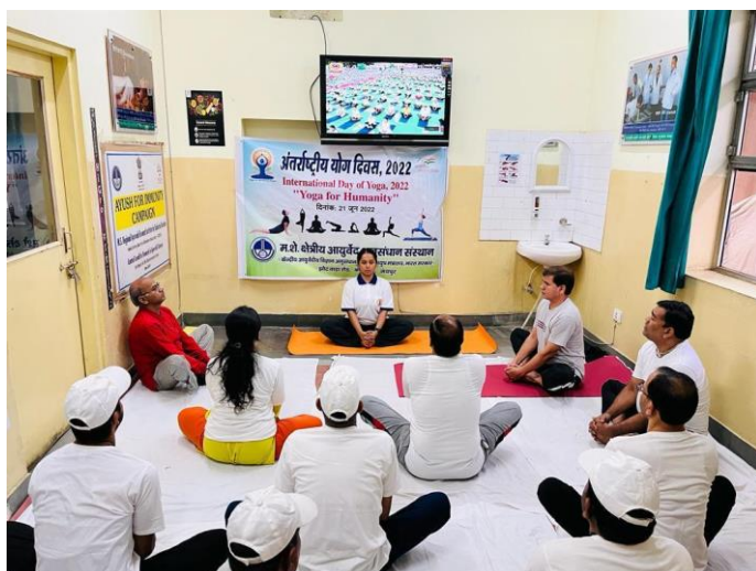
Celebration of 8 th IDY 2022 at MSRARI, Jaipur on 21st June, 2022