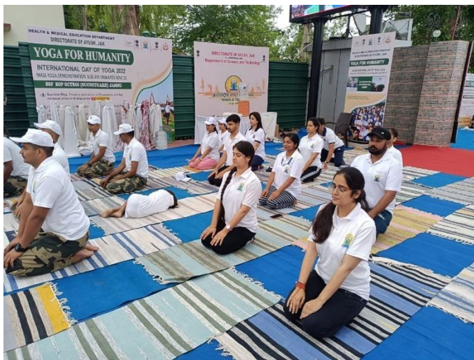
View of RARI, Jammu participation in the celebration of 8 th IDY 2022 at Cantonment Board School, Amritsar, Punjab