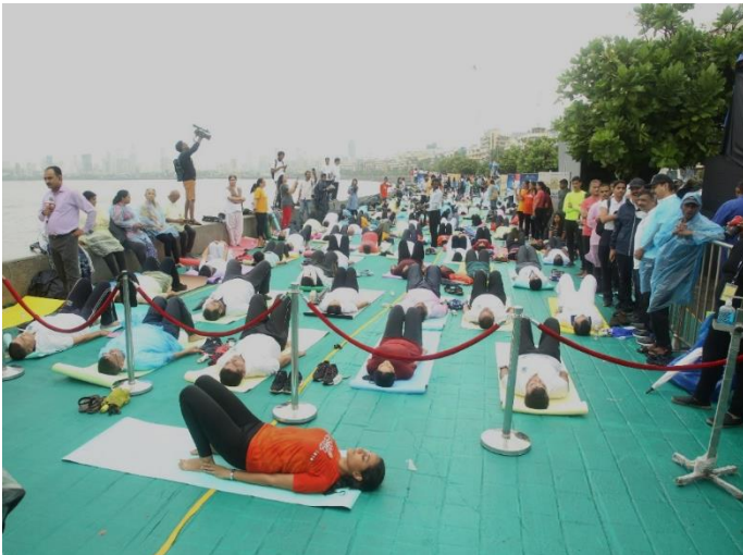
RRAP- CARI, Mumbai celebrated 8 th IDY at one of the iconic places Marine Drive, Mumbai on 21 st June, 2022