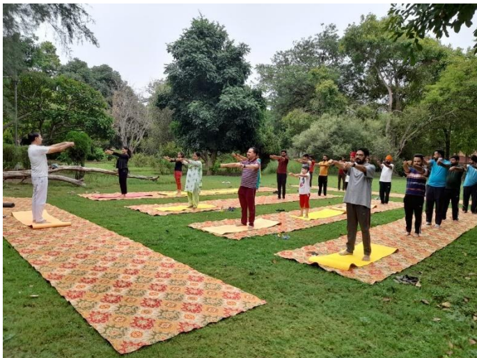
Officers and staff of CARI, Patiala performing asanas on the occasion of 8 th IDY on 21 st June, 2022.