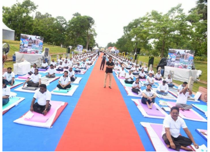
Glimpse of CARI, Bhubaneswar participation at Sun Temple, Konark during the celebration of 8 th IDY 2022