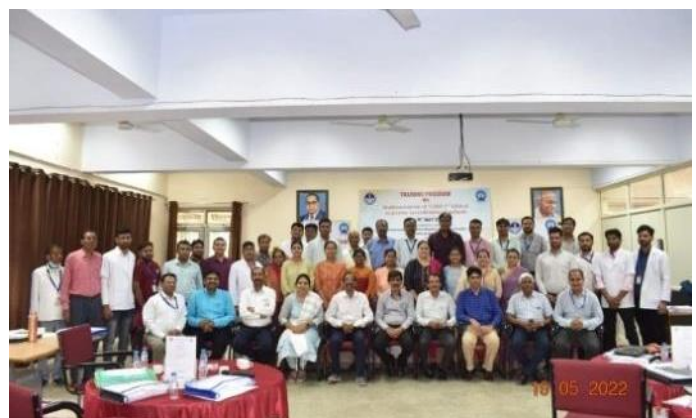
Glimpse of the participants during the NABH training programme organized by RARI, Gwalior in collaboration with the NABH-Quality Council of India from 17 th to 19 th May 2022