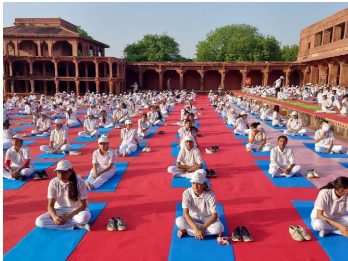
Glimpse of RARI, Lucknow participation in celebration of IDY 2022 at the iconic site Fatehpur Sikri, Uttar Pradesh.