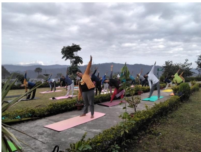
Officers and staff of RARI, Ranikhet, performing Yoga on the occasion of IDY 2022 on 21 st June, 2022.