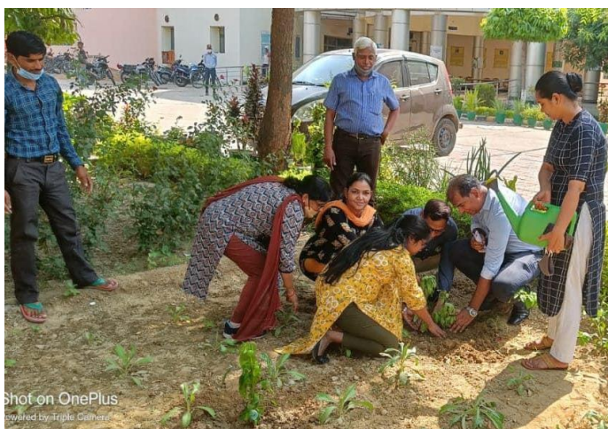
RARI, Lucknow, officials and staff planting saplings of medicinal plant on the occasion of World Environment Day.