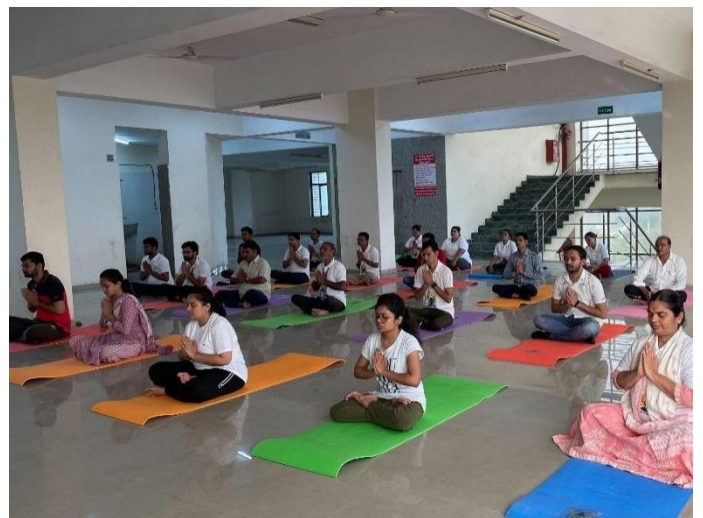
Officials and staff of RARI, Ahmedabad performing yoga in the institute premises on the occasion of 8 th IDY 2022