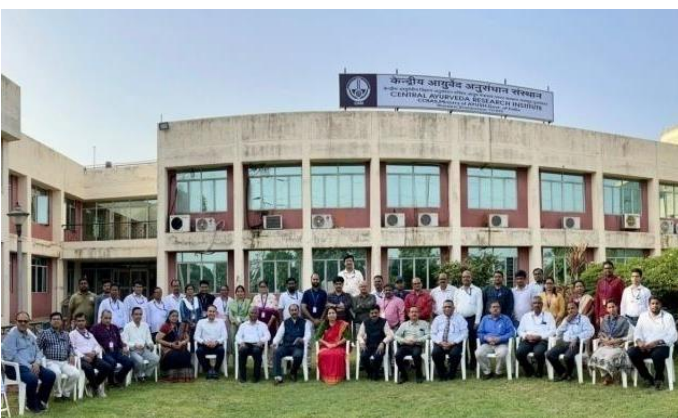
A Training Programme on the implementation of NABH standards for Ayurveda Hospitals was organized by the CARI, Bhubaneswar in collaboration with the NABH-Quality Council of India from 23 th to 25 th May 2022