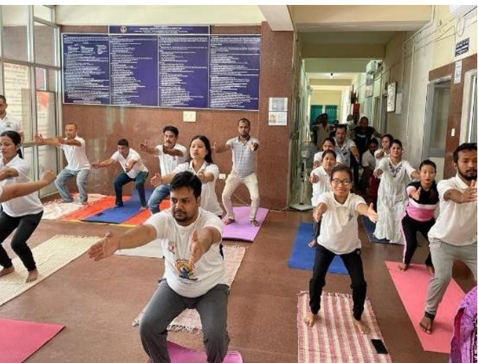
Glimpse of officials and staff performing yoga on the occasion of 8 th IDY at CARI, Guwahati on 21 st June, 2022