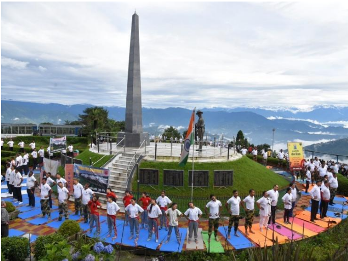
Glimpse of CARI, Kolkata participation in celebration of IDY 2022 at the iconic site named Mountain Railways of India (Darjeeling Himalayan Railways), Batasia Loop, Darjeeling.