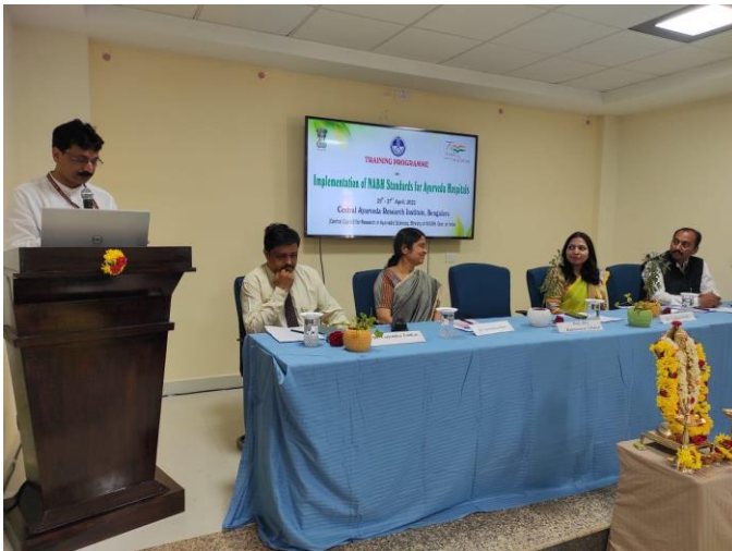
Glimpse of Prof. (Vd.) Rabinarayan Acharya, DG, CCRAS, encouraging all participants to attain NABH accreditation during the training programme on 'Implementation of NABH Standards' organized by CARI Bengaluru from 25 th to 27 th April, 2022.