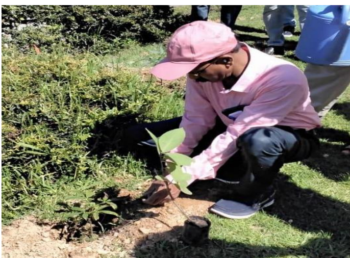
Glimpse of Institute incharge and officers planting the saplings of medicinal plants on the occasion of World Environment Day at RARI, Ranikhet.