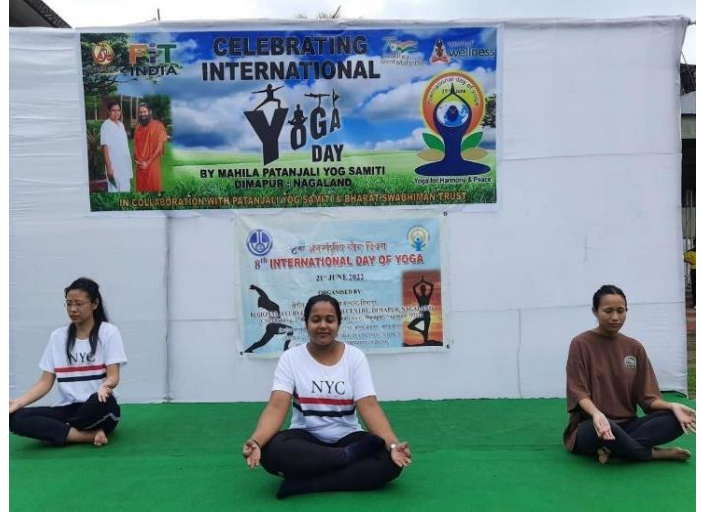
View of RARC, Dimapur participation in the celebration of 8 th IDY 2022 at Pranab Vidyapith Higher Secondary School on 21 st June, 2022