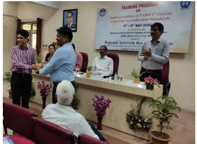
Officials of CARI, Jhansi during the training program on Implementation of NABH 2 nd Edition Ayurveda Accreditation standards at RARI, Gwalior from 17 th -19 th May, 2022