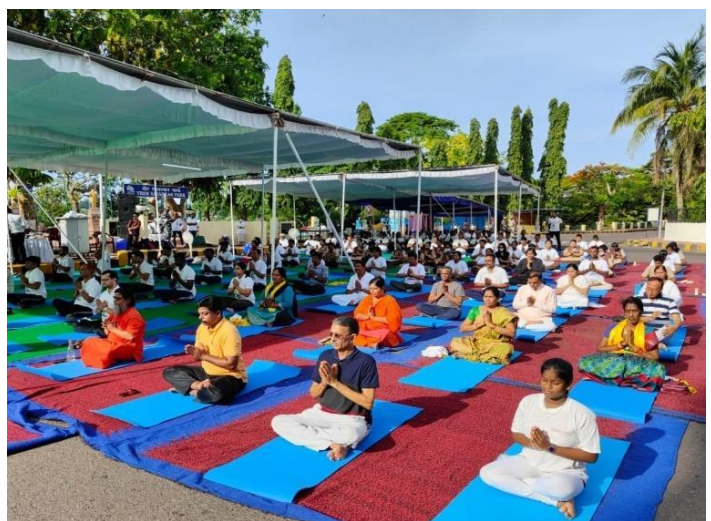
View of RARI, Port Blair participation in the celebration of 8 th IDY 2022 at National memorial Cellular Jail, Port Blair