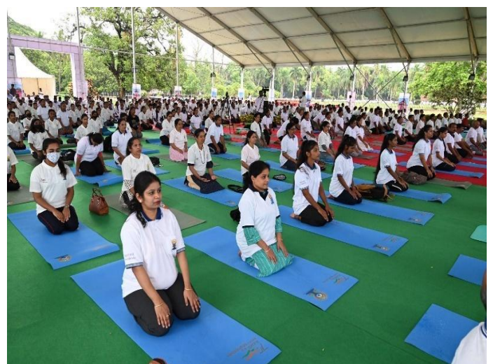
Glimpse of yogasanas performed by officials and staff of RARIM&MMR, GOA at at Largo of St. Francis Xavier, beside Se Cathedral, Old Goa