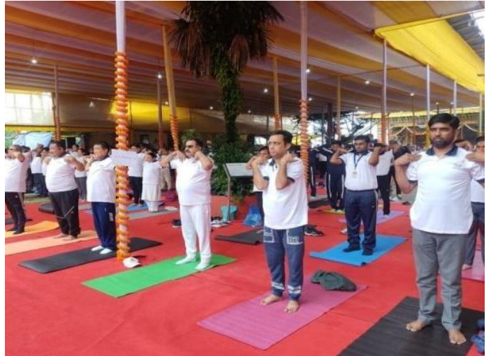
RARI, Gangtok celebrated 8 th IDY at one of the iconic places Enchey Monastery, Gangtok on 21 st June, 2022