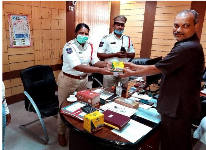
View of Ayu Raksha kit distribution by the A.D. In-Charge to the S.H.O. Malakpet, Traffic Police, Hyderabad