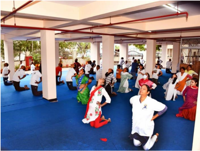
Officials and staff practicing yoga on the occasion of 8 th IDY 2022 at NCIMH, Hyderabad on 21 st June, 2022