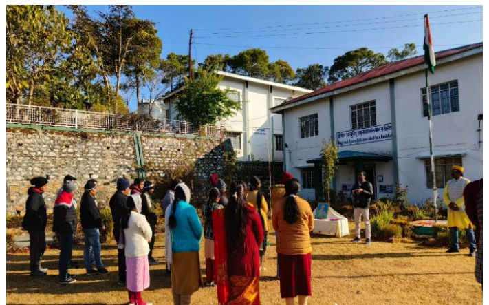
View of flag hoisting ceremony at RARI, Ranikhet on the occasion of Republic Day 2023