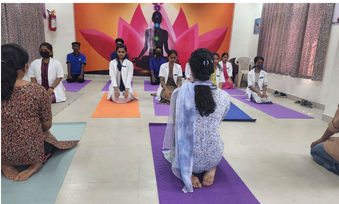
View of Yoga session performed by institute internees as a part of 100 days countdown to International Day of Yoga-2023 at NARIP, Cheruthuruthy.