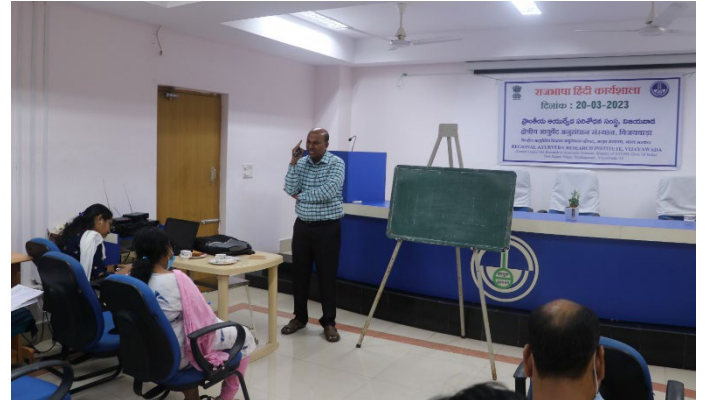
Glimpse of one day Hindi karyashala on the topic 'Necessity of Unicode' organized on 20 th March, 2023 at RARI, Vijayawada