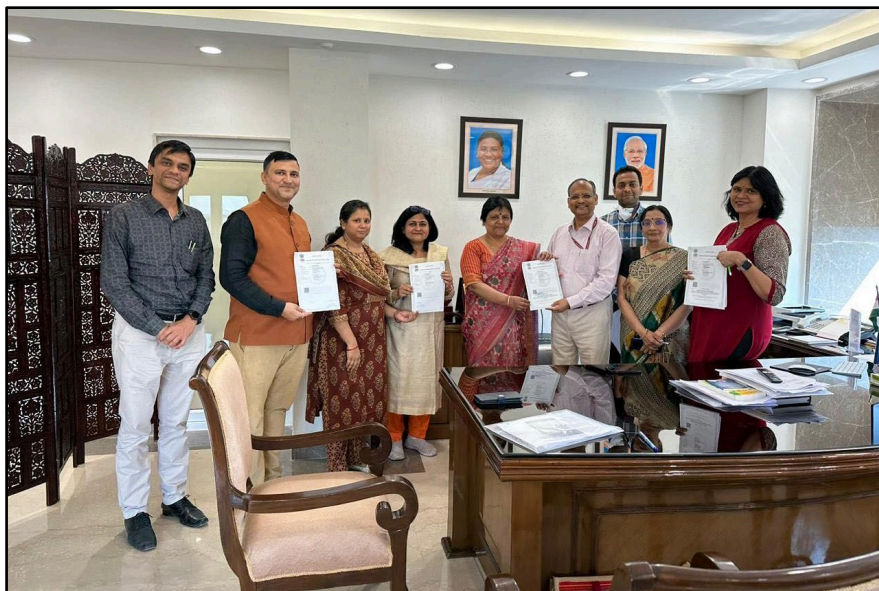
Glimpse of MoU exchange between CARI, New Delhi and Vardhman Mahavir Medical College (VMMC), Safdarjung Hospital, New for 3 collaborative projects on 14 th March, 2023.

Central Ayurveda Research Institute, New Delhi (CARI) on behalf of CCRAS signed MoU with Vardhman Mahavir Medical College (VMMC), Safdarjung Hospital, New Delhi for 3 collaborative projects on 14 th March 2023. These Collaborative Studies are on PCOS, stable coronary artery disease & hypertension-induced left ventricular hypertrophy to validate the Ayurvedic intervention and to add to the management of the disease. This study will be of three years duration with budgetary support provided by the Ministry of Ayush through CCRAS.