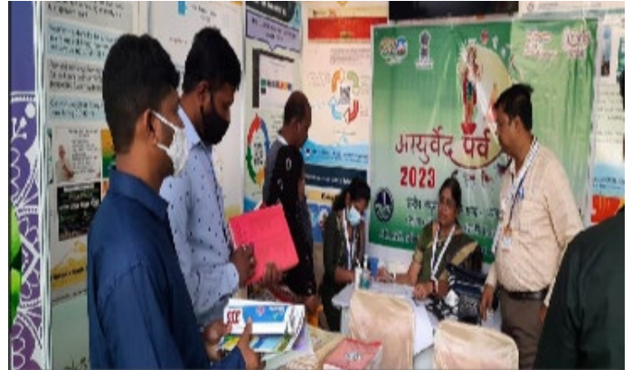
Glimpse of CARI, Bhubaneswar stall during Ayurveda Parva held from 20 th January, 2023 – 22 nd January, 2023 at Gopabandhu Ayurveda Mahavidyalaya, Puri, Odisha