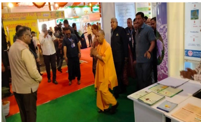
Glimpse of Hon,ble, Vice President of India , Sh. Jagdeep Dhankar; Smt. Anandiben Patel, Governor, Uttar Pradesh, and Sh. Yogi Adityanath, CM, Uttar Pradesh visited CARI, New Delhi stall during Ayurveda Parv organized at CCS University, Meerut held from 11 th to 13 th March, 2023.