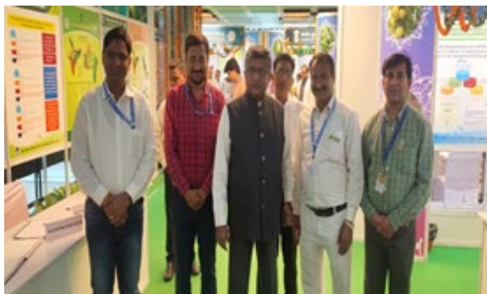
Glimpse of Sh. Ravishankar Prasad, M.P., Lok Sabha visited CCRAS stall during Ayush camp organized at Parliament house annex, New Delhi from 20 th to 24 th March, 2023.