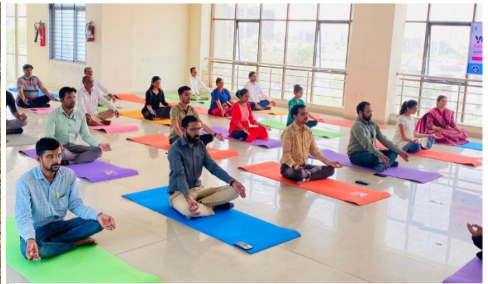
View of Yoga session performed by institute officials as a part of 100 days countdown to International Day of Yoga-2023 at RARI, Ahmedabad.