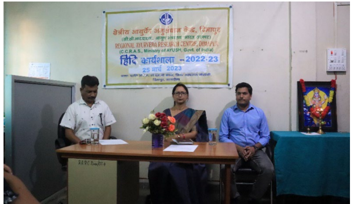
View of one day Hindi karyashala organized on 25 th March, 2023 at RARC, Dimapur,