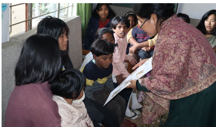
Glimpse of awareness talks on Millets as a part of celebration of 'International Year of Millets -2023' by RARC, Dimapur team at Prodigral's Home, Fellowship colony, Dimapur