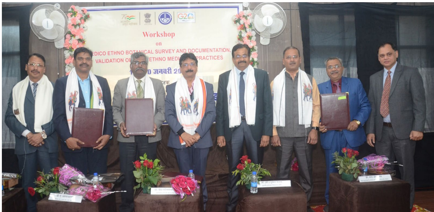
Glimpse of two MoU's signed between CARI, Jhansi and two Premiere institutions of Jhansi during inaugural ceremony of three days' workshop on 'Documentation & Validation of LHT & EMP' on 18 th January, 2023.

Central Ayurveda Research Institute (CARI), Jhansi organized a three-day workshop on 'Documentation & Validation of Local Health Tradition (LHT) & Ethno-Medical practices (EMP)' for CCRAS scientists from