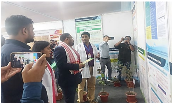
Shri Bimal Borah, Hon'ble Minister of Industry, Commerce and Public Institutions and Cultural Govt. of Assam visited CARI, Guwahati Stall during 12 th East Himalayan Trade Fair organized at Engineering Institute Playground, Chandmari, Guwahati from 06 th February, 2023 to 12 th February, 2023.