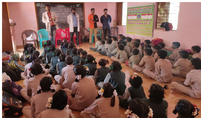
Glimpse of awareness lecture on 'Importance of Millets and its nutritional and medicinal uses' delivered to the students of Govt. Tribal Middle School, Chennai by officials of RARI, Vijayawada.