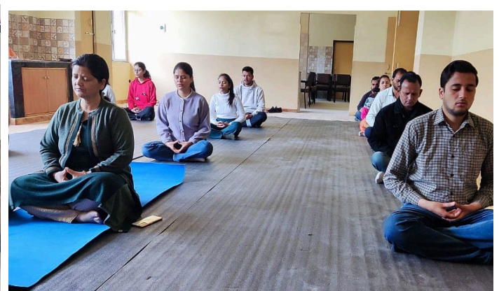
View of Yoga asanas performed by the institute officials and employees as a part of 100 days countdown to IDY-2023 at RARI, Mandi.