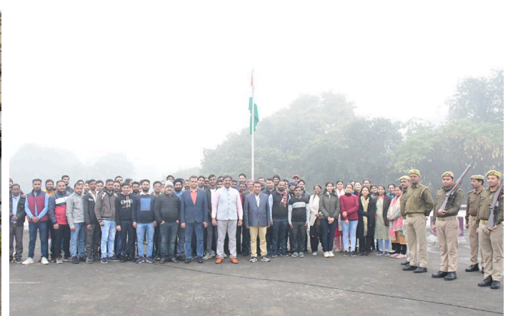
Glimpse of flag hoisting ceremony at CARI, Jhansi on the occasion of Republic Day 2023