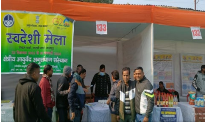
Glimpse of RARI Lucknow Stall during 'Swadeshi Mela' organized at Central Park, Kanpur from 25 th December, 2022 to 03 rd January, 2023.

The Central Council for Research in Ayurvedic Sciences with its peripheral institutes across the country participated in various Arogya Melas, Ayurveda Parvs, etc. to disseminate Ayurveda. During the events, display stalls were arranged for the visitors in which Council's publications & Council's activities were displayed and free brochures were distributed to the visitors for publicity. Free medical check-up camps were also organized to provide medical consultation and free medicines were distributed, A glimpse of some of the activities are: