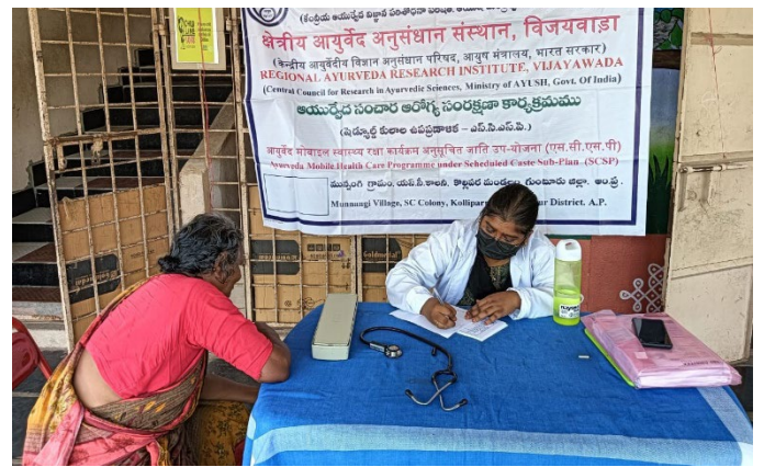
Glimpse of Survey team of RARI, Vijayawada conducting Medical and Health check-up camps under THCRP and AMHCP Project.