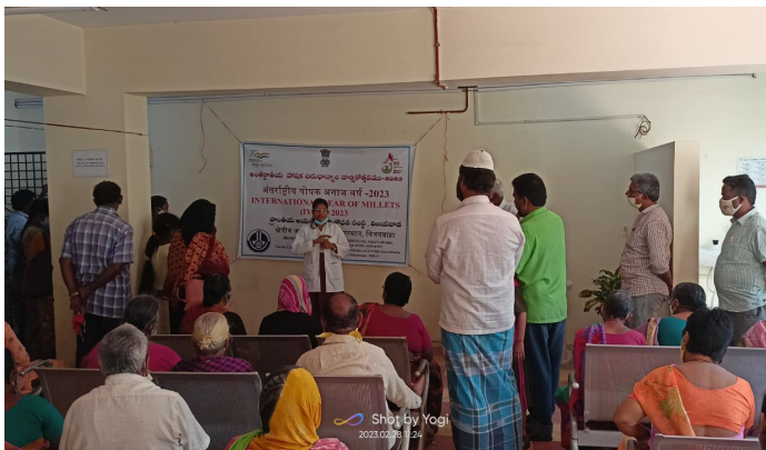
Glimpse of awareness lecture delivered to the OPD patients organized as a part of celebration of 'International Year of Millets -2023' at RARI, Vijayawada

CCRAS is celebrating 'International Year of Millets -2023' through its robust network of peripheral institutes across the country where approximately 344 activities in the form of Lectures, Awareness Programmes, Displaying of Millets, etc. were organized in the month of January to spread, promote and propagate information and importance of Millets across the country to lead a healthy lifestyle. More than 11,504 people received benefits from the various activities. A glimpse of some of the activities are: