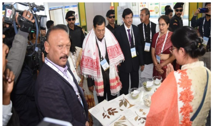
Glimpse of Hon'ble Ayush Minister, Sh. Sarbananda Sonowal visited CARI, Guwahati stall during 4 days 'National Arogya Summit focusing on Traditional Medicine under SCO' at Radisson Blu, Guwahati, held from 2 nd March, 2023 to 5 th March, 2023.