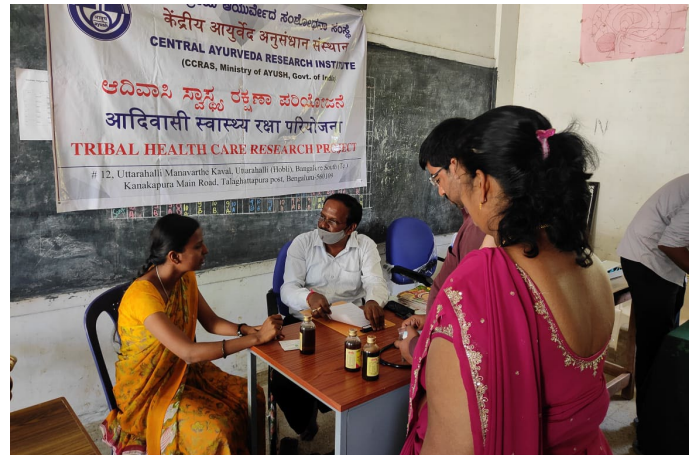
Glimpse of Survey team of CARI, Bengaluru conducting Medical and Health check-up camps under THCRP and AMHCP Project.