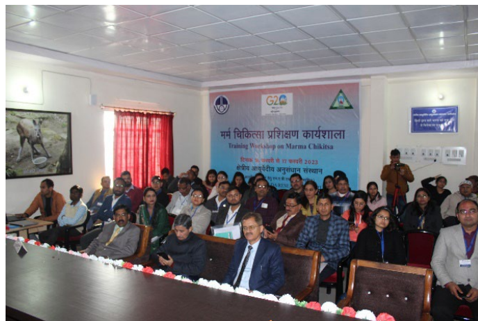
Glimpse of training session during Marma Chikitsa training workshop organized at RARI, Ranikhet held from 16 th – 17 th February, 2023