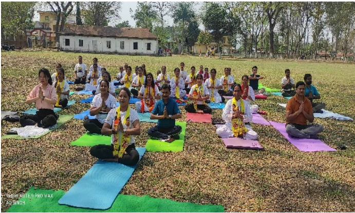
Glimpse of Yoga Asanas performed by centre officials as a part of 100 days countdown to International Day of Yoga-2023 at RARC, Dimapur.