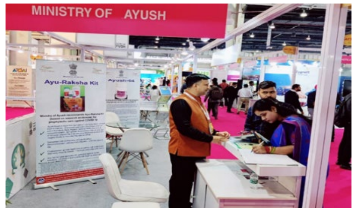
Glimpse of CARI, New Delhi Stall during 30 th Edition of South Asia's Travel & Tourism Exchange (SATTE) organized at India Expo Centre and Mart, Greater Noida, Uttar Pradesh from 09 th February, 2023 to 11 th February, 2023.