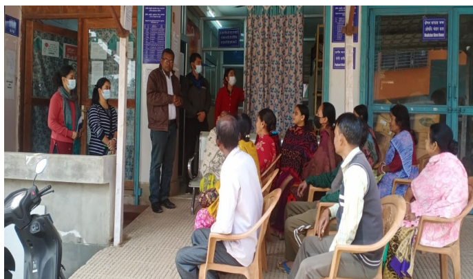
Glimpse of awareness session organized at centre's OPD as a part of celebration of 'International Year of Millets -2023' by RARC, Agartala